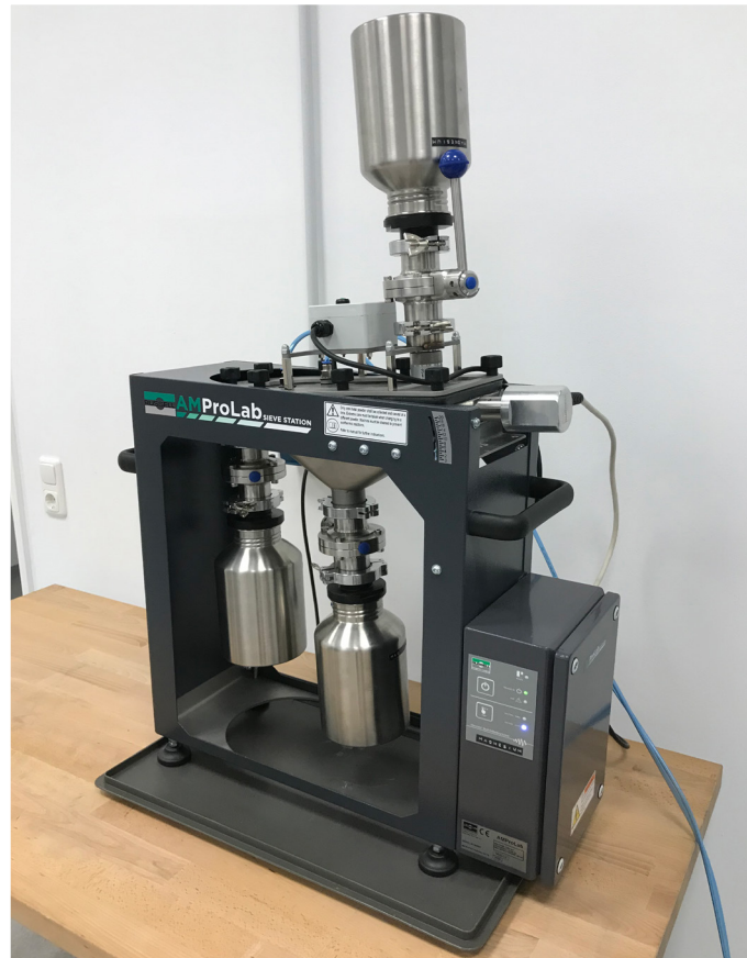
Figure 2: The Russell AMPro® Lab